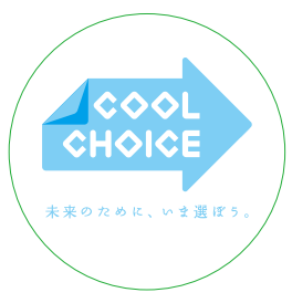
Supporting COOL CHOICE